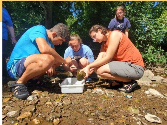
Students looking for macroinvertebrates from a sample taken from the Manatawny Creek, a tributary to the Schuylkill River in Montgomery County.