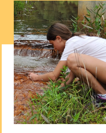
A student testing water quality at the Silver Creek Abandoned Mine Drainage Treatment System in Schuylkill County.