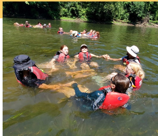
Cooling off in the Schuylkill River with some games!

Schuylkill Acts & Impacts (SAI) is a week-long watershed expedition along the 120 miles of the Schuylkill River, from its headwaters in the anthracite coal lands of Schuylkill County to its confluence with the Delaware River in Philadelphia.