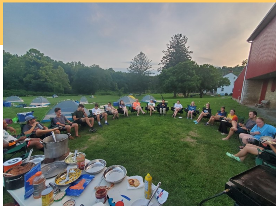
Camping in Berks County.